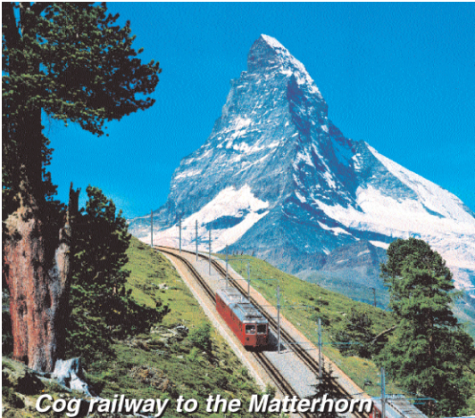
Cog railway to the Matterhorn