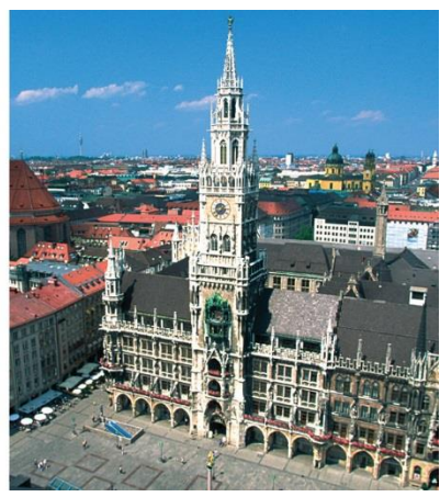
Highlights... Vienna, Danube Cruise, Salzburg, Dinner at St. Peter's Stiftskeller, Munich, Oberammergau, Innsbruck, Bavarian Castles, Black Forest, Chateau de Chillon, Zermatt, Lucerne, Cheese Fondue

Day 1: Thursday, May 19, 2016 Overnight Flight Set out to explore three distinct Alpine cultures set amid incredible landscapes.